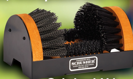
Original H1 •

Effortlessly removes debris from all footwear. Ideal for sports, home, ranch, workplace and cabin.