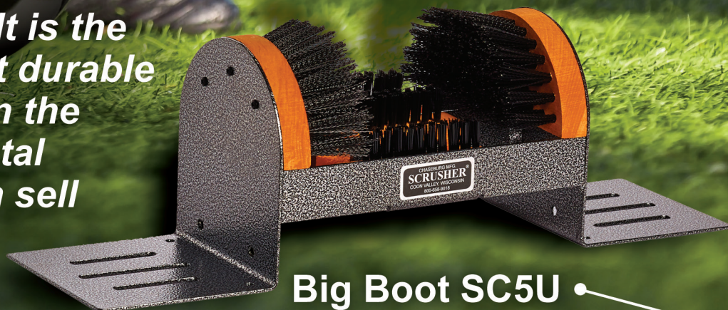
Big Boot SC5U •